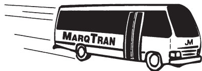
PRIDE PRINTING 1/17